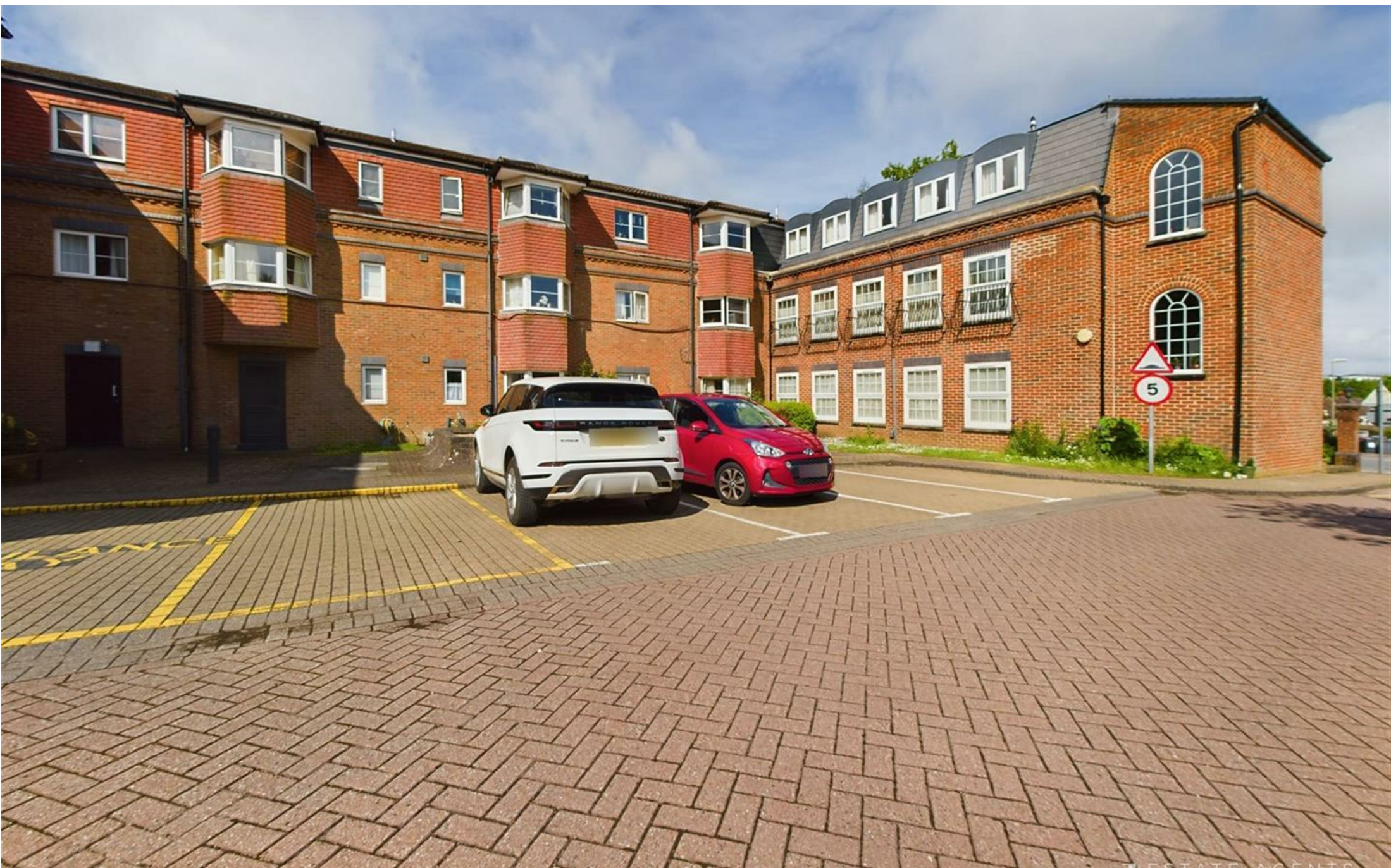
Westdeane Court, Basingstoke, RG21 8SX